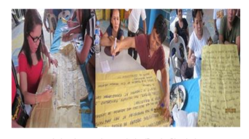
Series of community consultation (Peoples Planning)