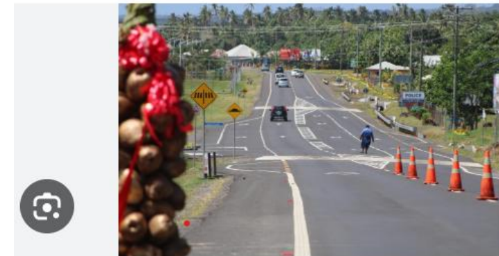
Samoa Observer | $115M tala West Coast Road commissioned