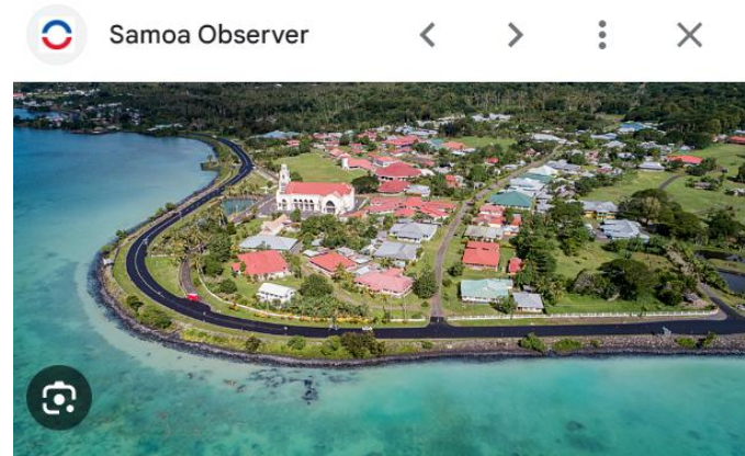
Samoa Observer | Local company gets West Coast Road contract