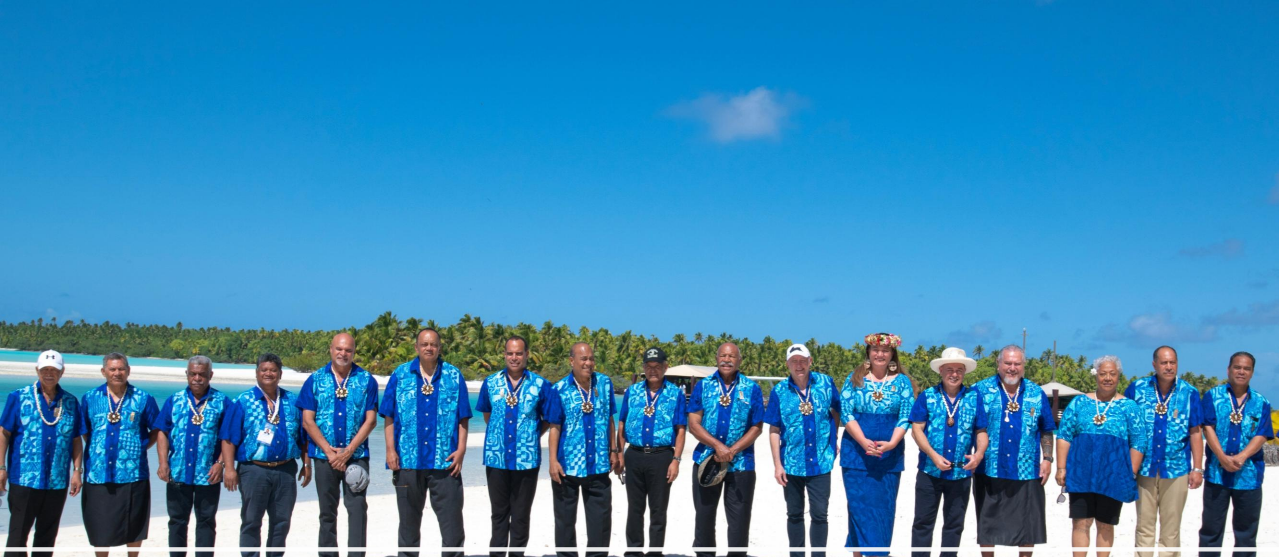
Pacific Forum Leaders 2023, Cook Islands