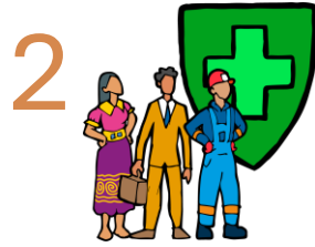
2 Fair & safe work