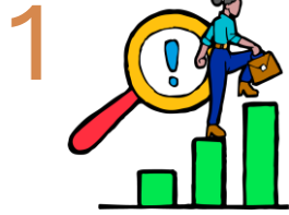
1 Gender & Equality