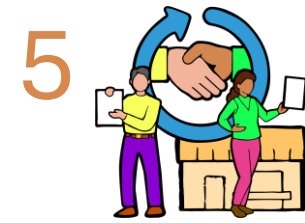
5 Land & Livelihoods