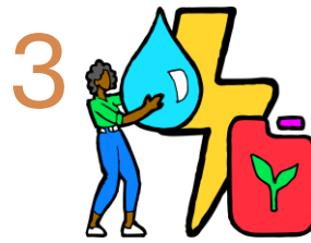
3 Pollution & Waste