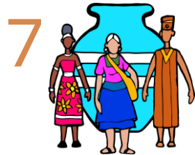
7 Indigenous communities