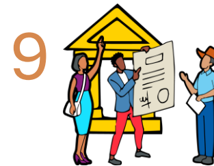
9 Climate Change