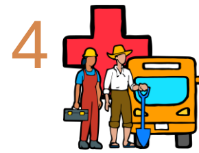
4 Community health & safety