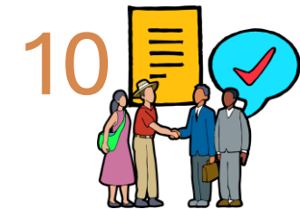
10 Social Inclusion