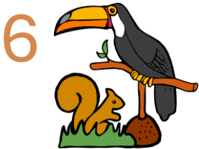
6 Nature & biodiversity