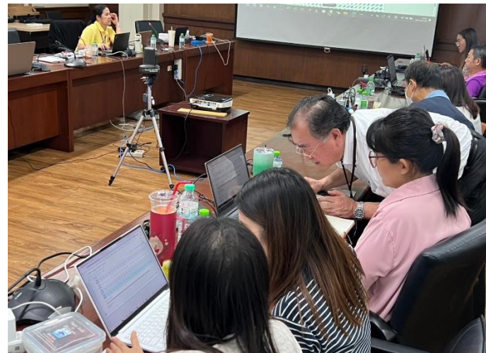
Thematic training 2 (Monitoring data analysis, Feb 2025)