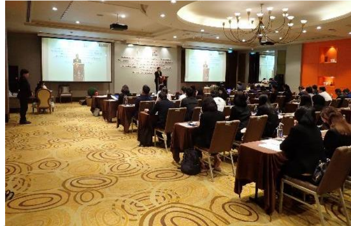
General Training 1 (Before Crisis Season, Dec 2025)