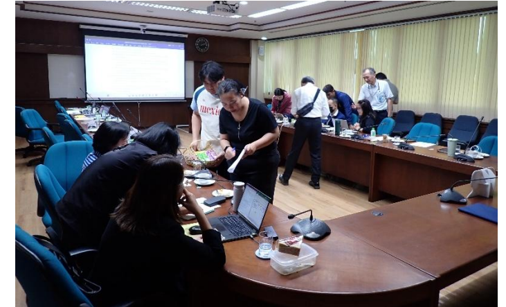
Thematic training 1 (Emission Inventory, Jan 2025)