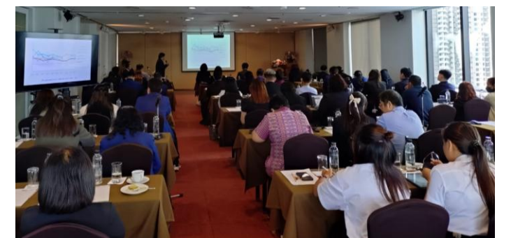
General Training 2 (After Crisis Season, May 2025)