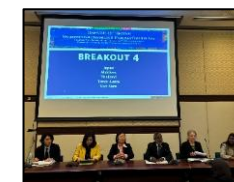
Panel Discussion on the Country Reporting