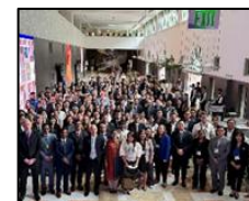
Participants from Countries and Organizations