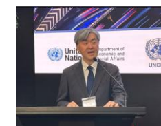
Opening and Closing Remarks