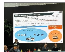
Presentation on Air Pollution Policies