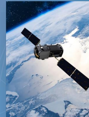
Green Finance and Data