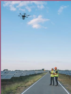
Clean Energy and Industry

50+ Companies with Transformative Solutions and Climate Impact in over 18 Countries Across Asia.