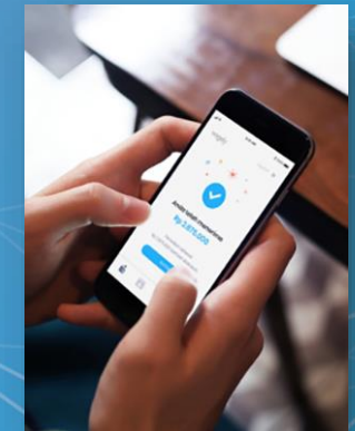
Inclusive & Resilient Communities