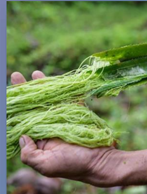
Circular Economy & Green Materials