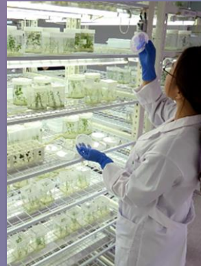
Sustainable Agriculture & Food