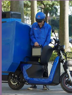
Sustainable Mobility & Supply Chains