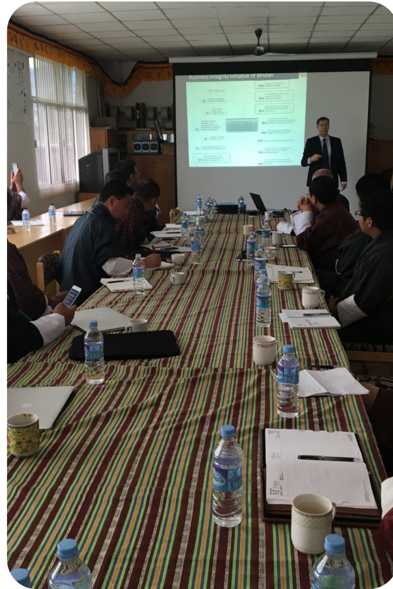
Awareness Thematic sessions (Concept and Case Examples)