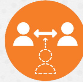
Competency of third party