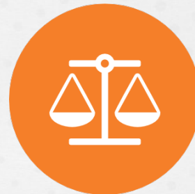
Approach to ethics and compliance