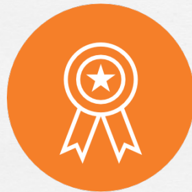
Reputation: Commercial references