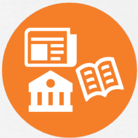
Public records resources: History of corruption and adverse news