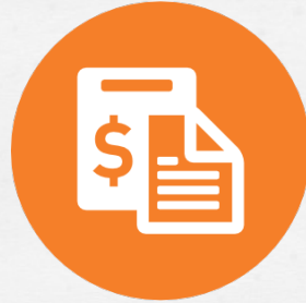
Financial background and payment of contract