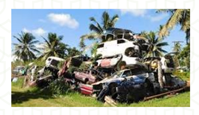
Landfill o perations