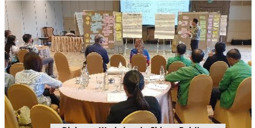
Dialogue Workshop in Chiang Rai (June 2023)