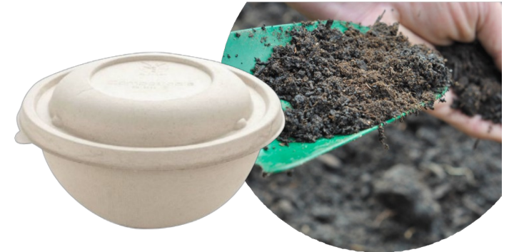
Food packaging and biofertilizer (illustration)