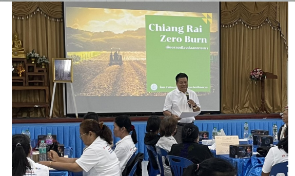
All-female farmer training on straw management in cooperation with PepsiCo and Agricultural Extension Department