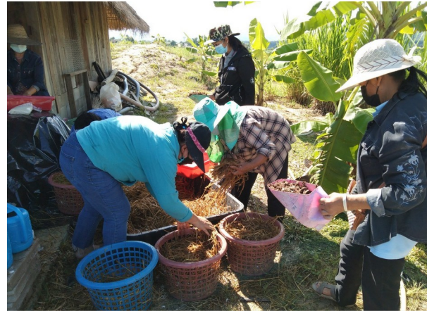
Training on Mushroom Cultivation