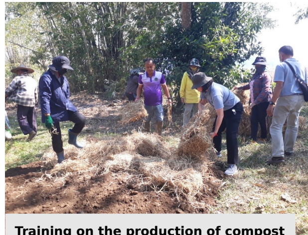
Training on the production of compost