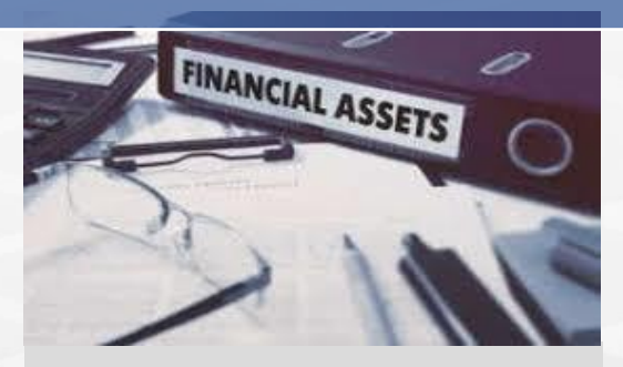
ASSETS AND LIABILITIES INSPECTION AND UNUSUAL WEALTH INQUIRY