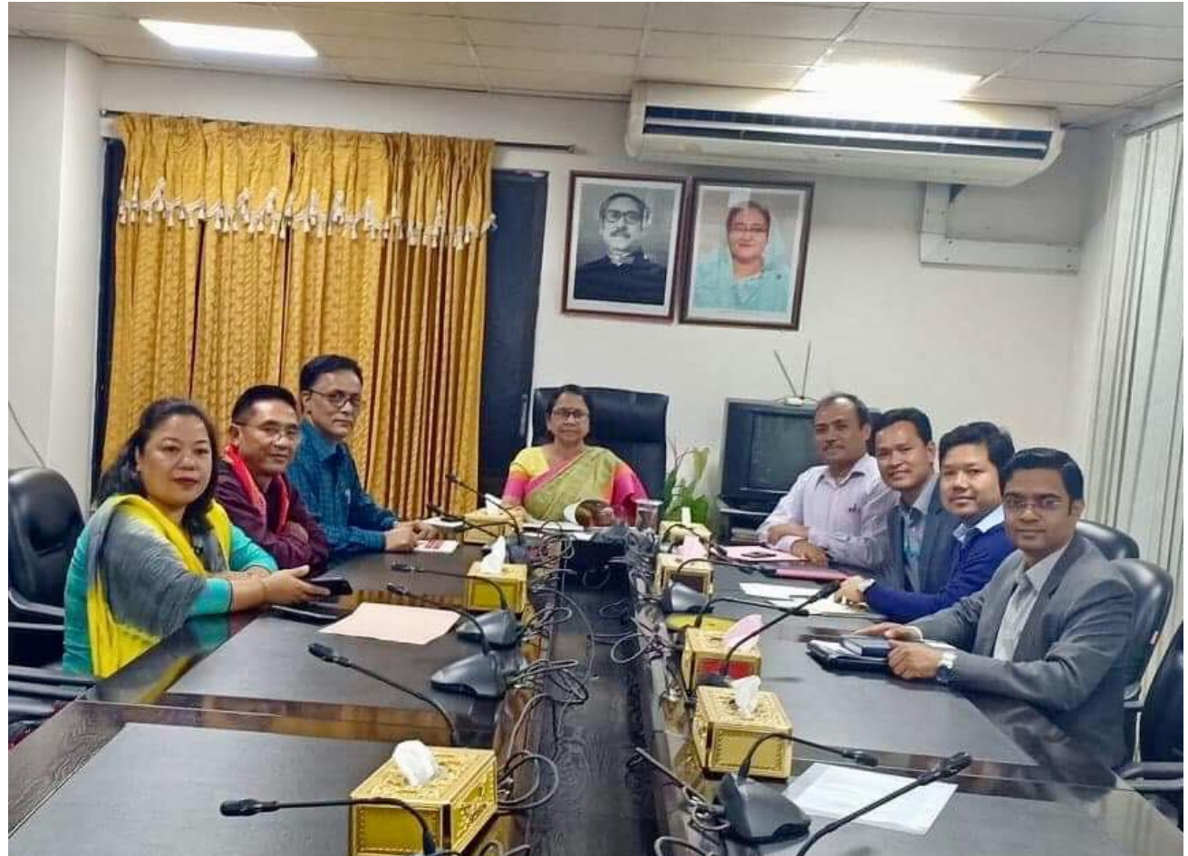
Engagement of IPs with Bangladesh Bureau of Statistics