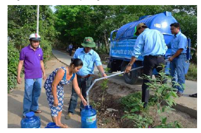
Figure 3: Water delivery by truck in Soc Trang