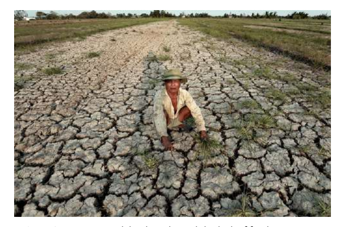
Figure 2: Farmer struck by drought and the lack of freshwater

Farmers are converting rice farms to shrimp ponds and fish ponds, which further damage the soil due to the excessive use of antibiotic and residual foods