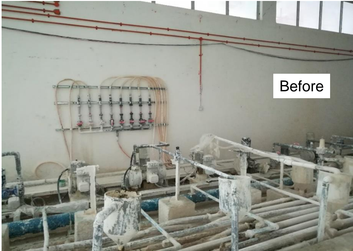
Chemical dosing unit