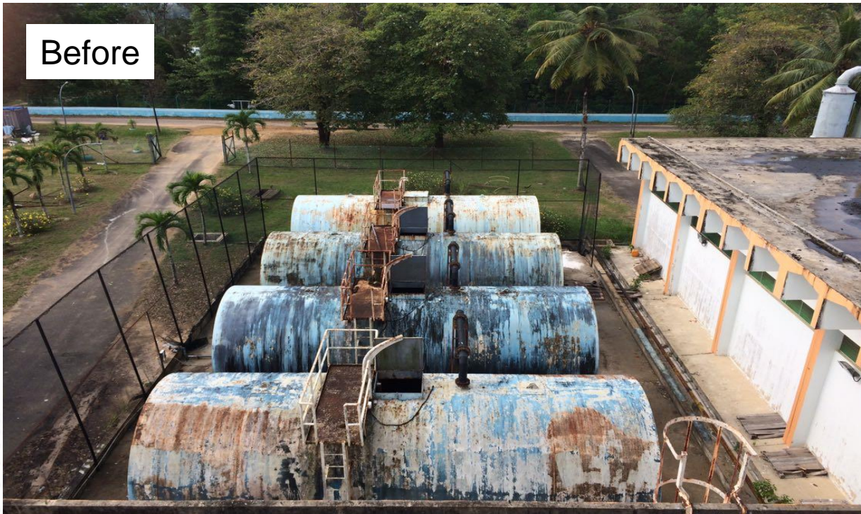
Alum storage tank