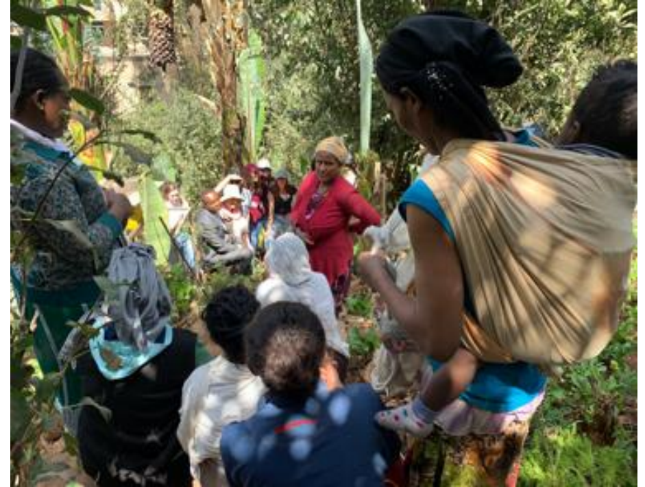
Gulele, Addis Ababa, 2020