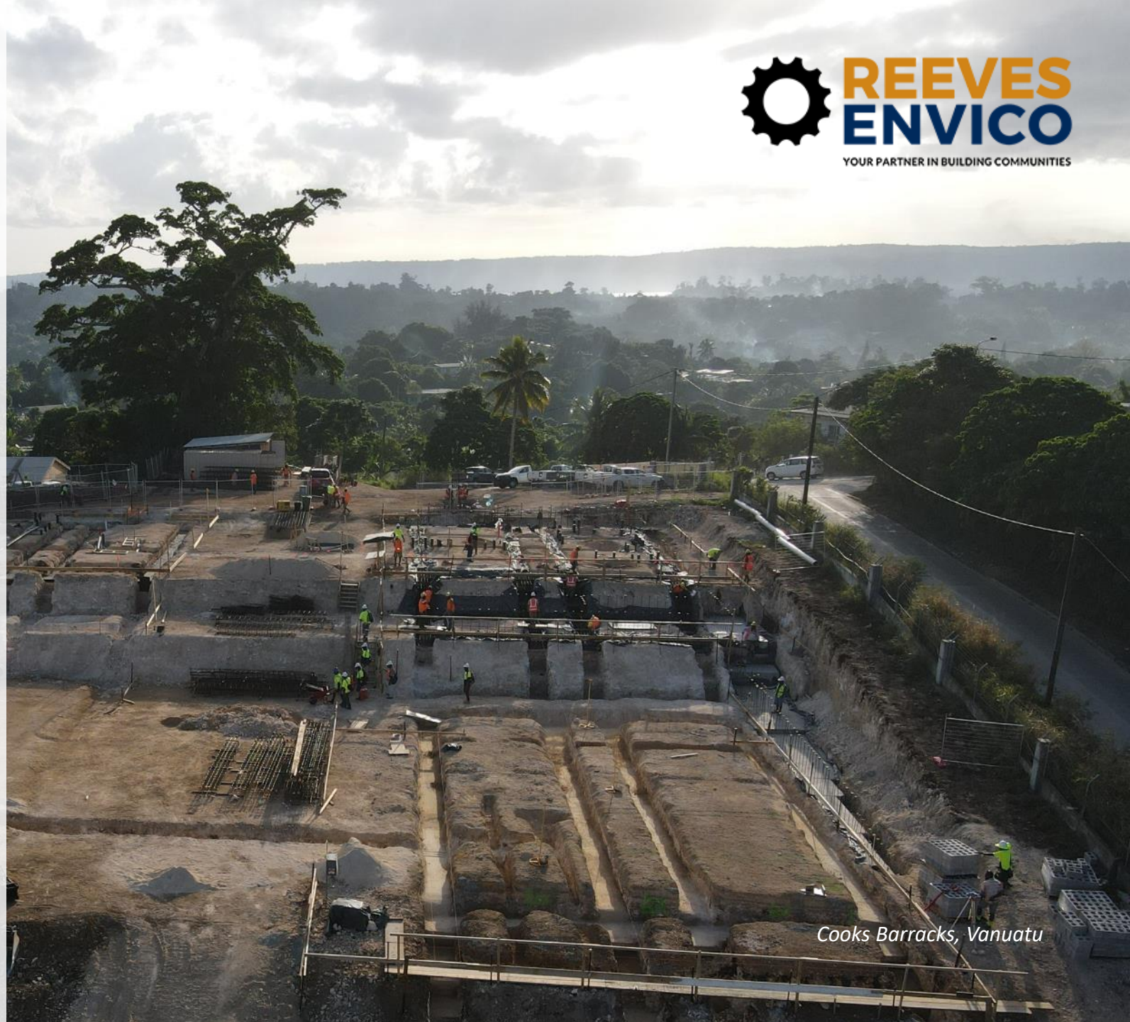
Cooks Barracks, Vanuatu