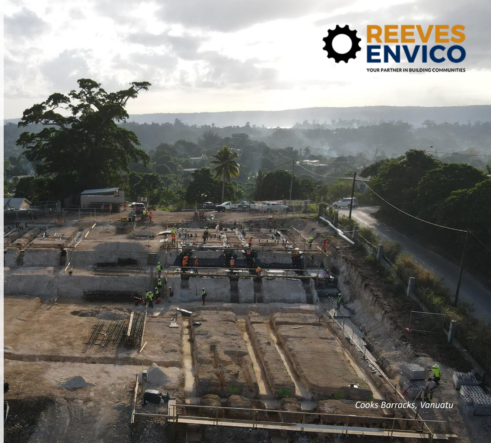
Cooks Barracks, Vanuatu