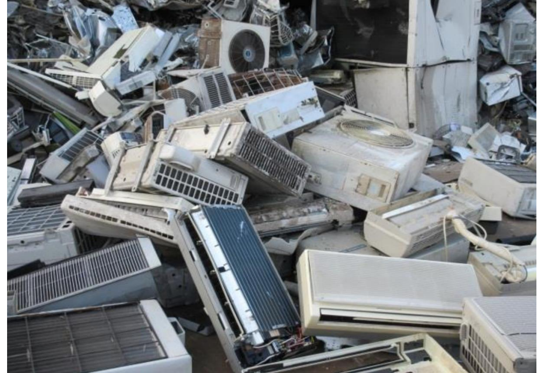
Air conditioners improperly disposed (sample image)