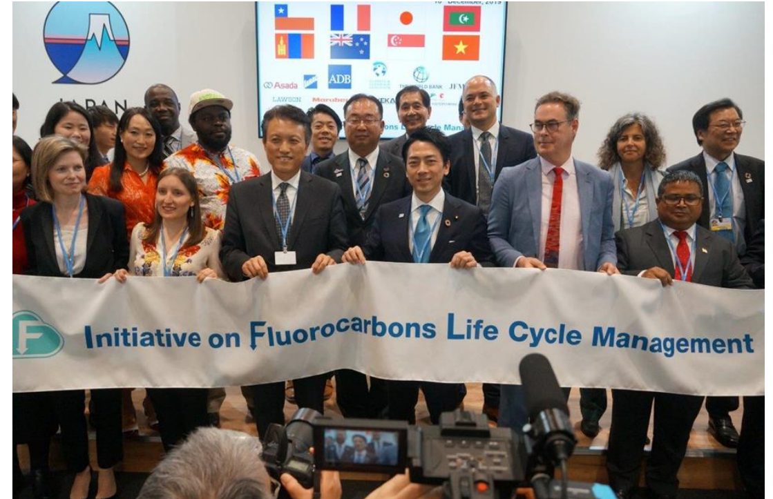
Launching event of IFL at COP25