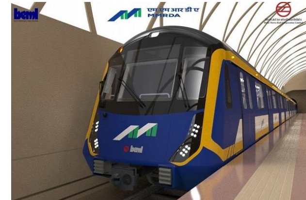
Rolling Stock – Mumbai Metro