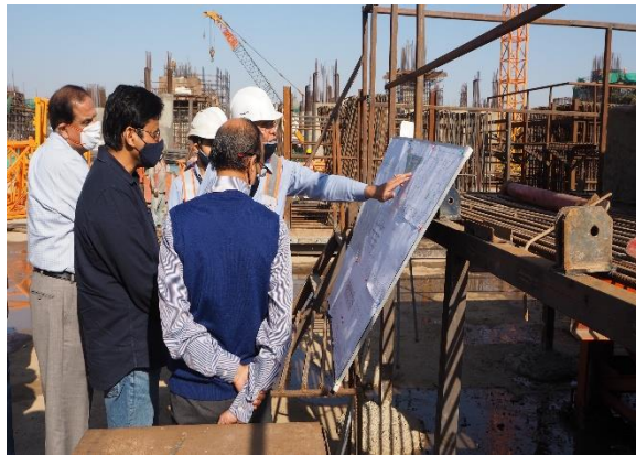
Civil works – Delhi Meerut RRTS Project

Rolling stock Signaling and Telecommunications