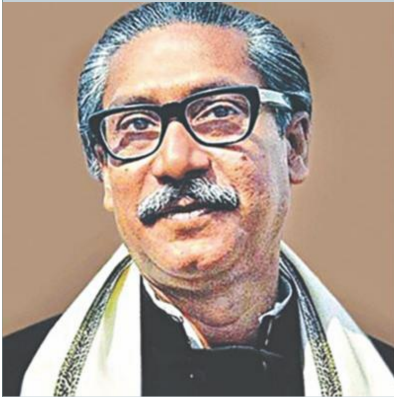
Bangabandhu Sheikh Mujibur Rahman Father of the Nation, Bangladesh