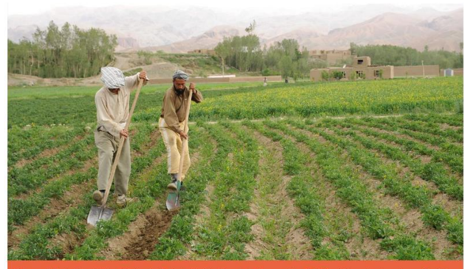
Enhanced Agricultural Value Chains for Sustainable Livelihoods built more than 2,800 potato and onion storage facilities in Bamyan, Kabul and Parwan, helping farmers reduce their potato harvest losses by as much as 40%.