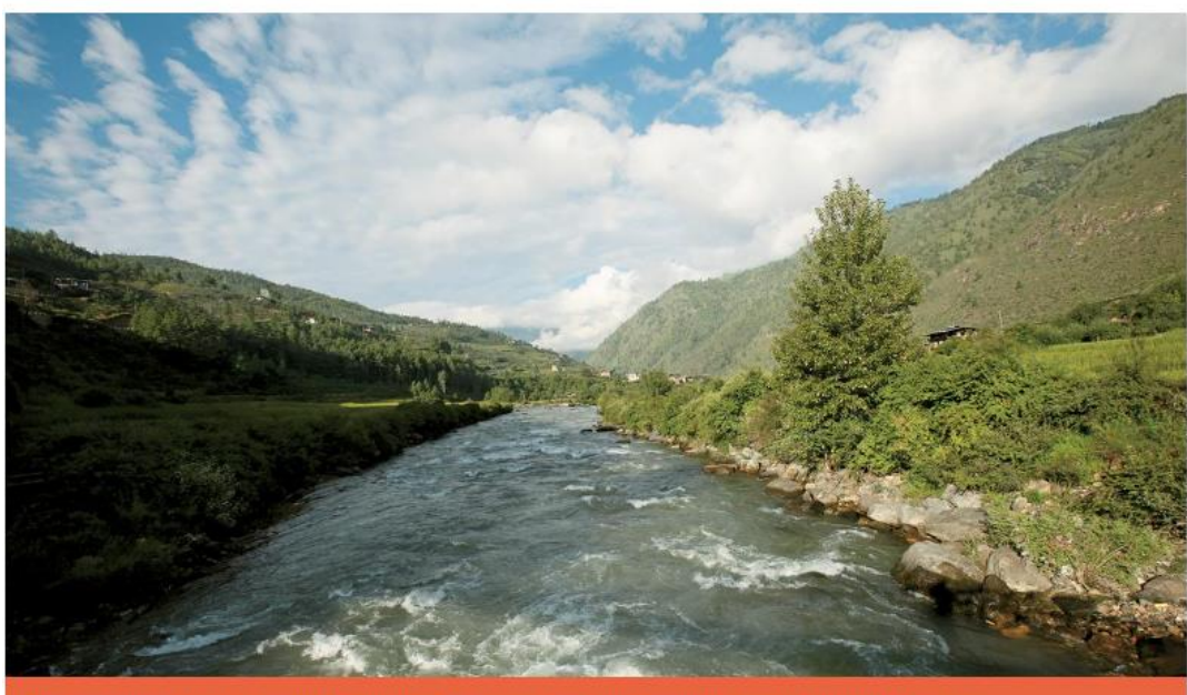
The main river of the Wangchhu Basin, the Thimchhu River runs through the capital city of Thimphhu.

Bhutan is set to efficiently and sustainably tap its abundant, yet fragile, water resources.