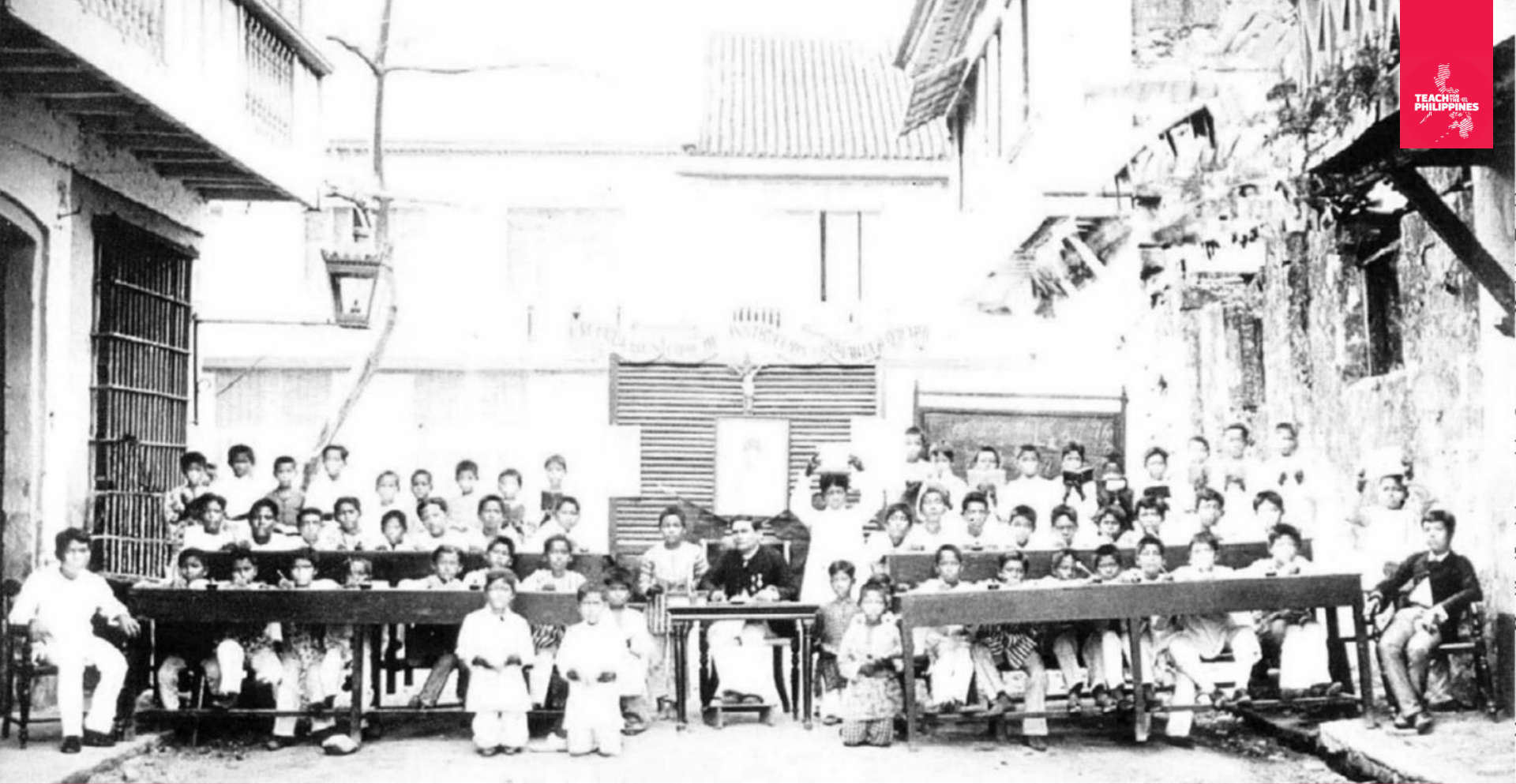
Manila: Students of the Escuela Municipal de Instrucción Primaria de Quiapo (1887).