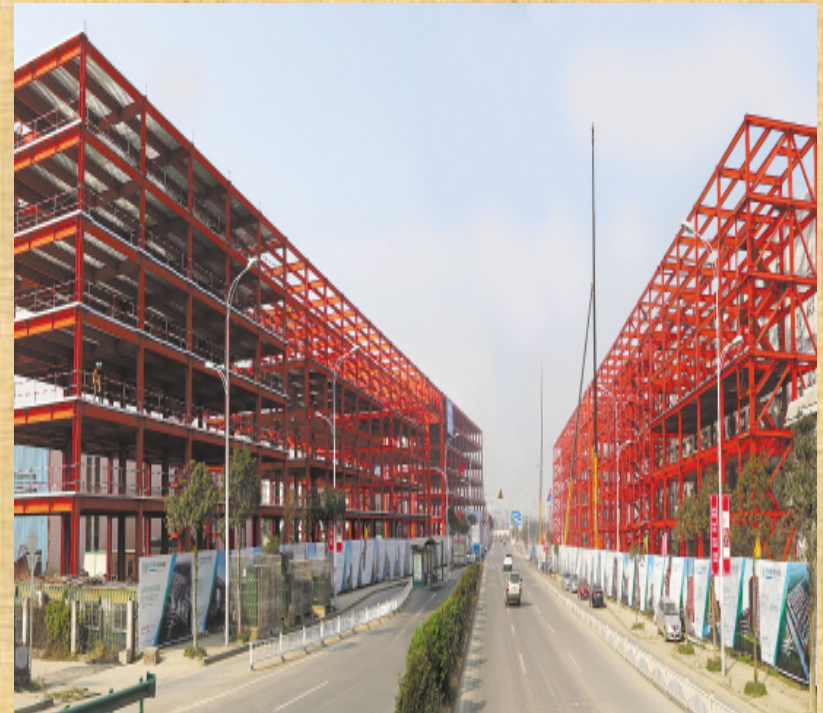
6 level plants in Feiyue Sewing Science Park in Taizhou

http://www.taizhou.com.cn/myjj/2016-01/06/content_2740137.htm