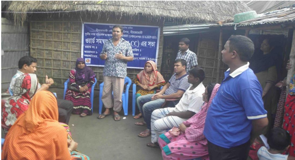
Word Committee Meeting at Nilphamari Pourashava