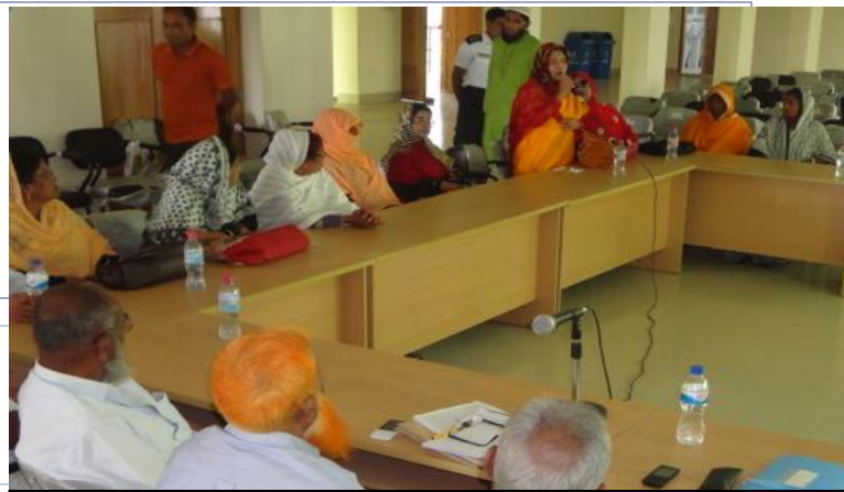
Women participation in TLCC Bera