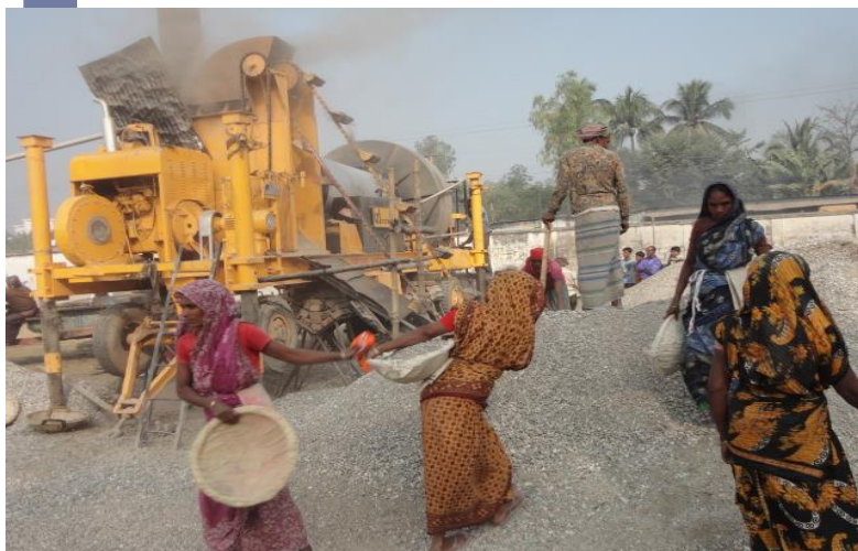
Women laborer in construction work: Bera PS