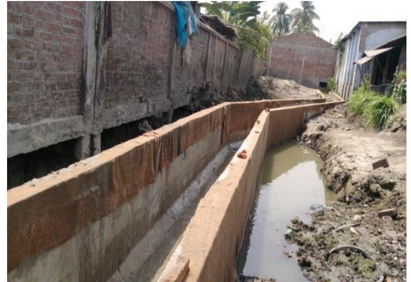
Drain: PDP-52, Ishwardi Pourashava