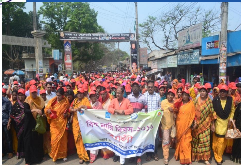
Huge women participation on IWD'16: Jessore PS