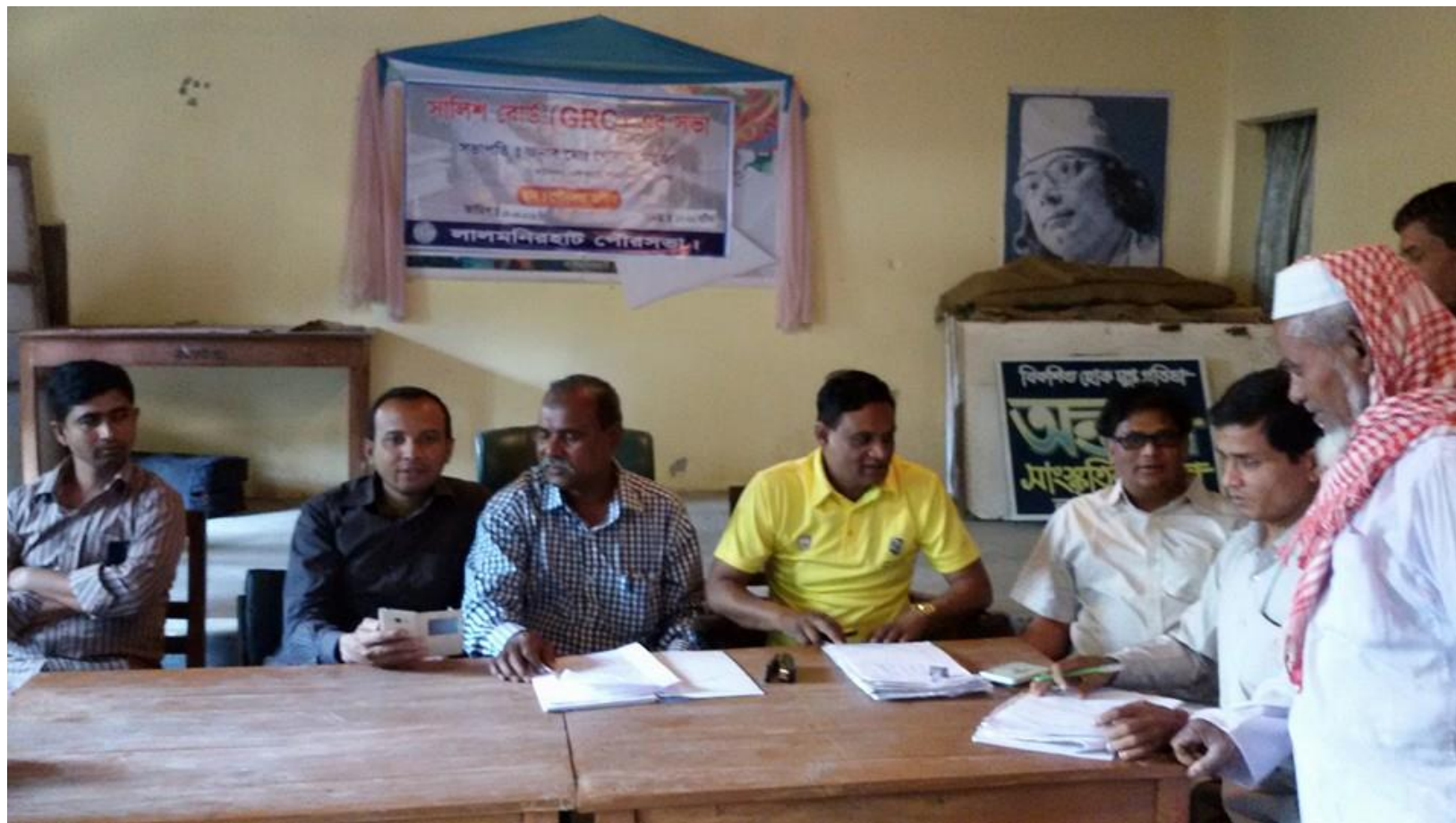
A Session of GRC at Lalmonirhat Pourashava