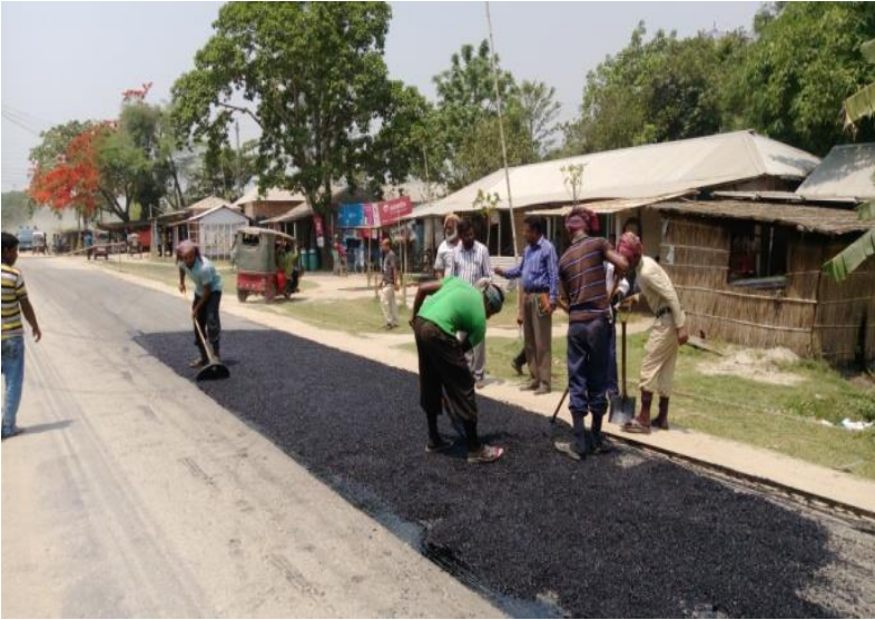
Road: Ishwardi Pourashava