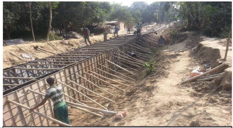
Drain: Charghat Pourashava