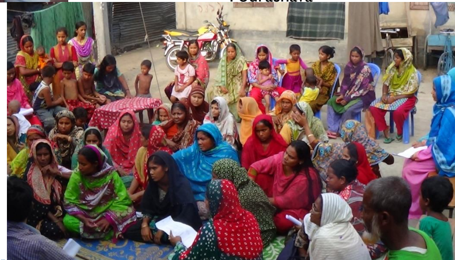
Courtyard Meeting at Naogoan Pourashava