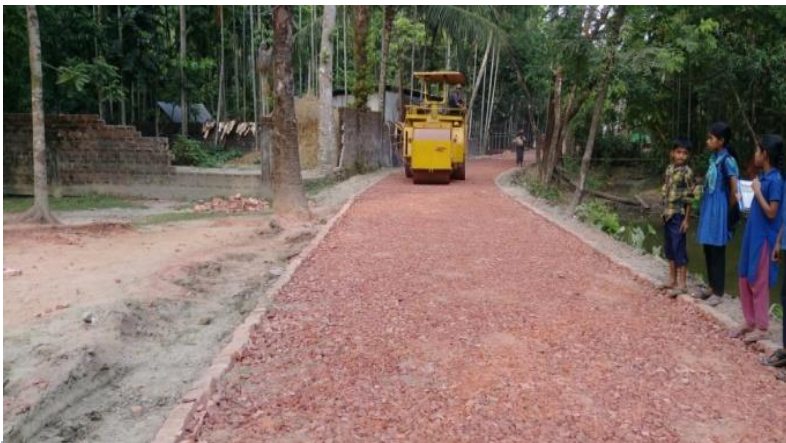
Road: Laxmipur Pourashava