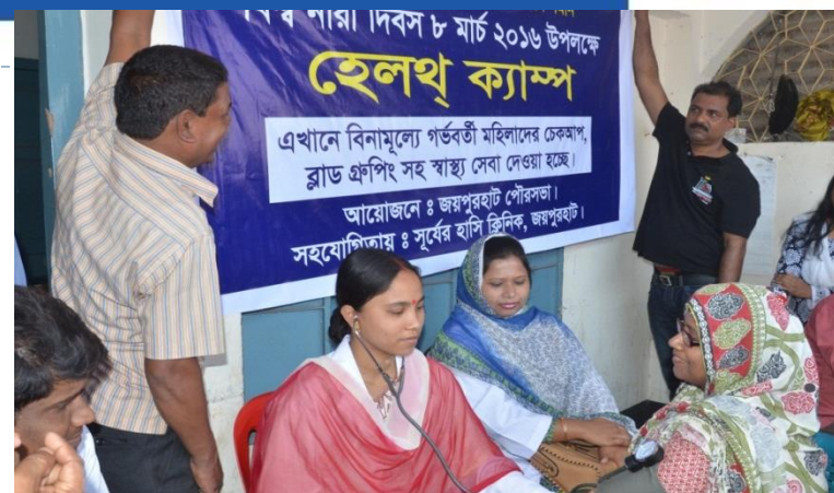
Health camp for women on IWD Joypurhat