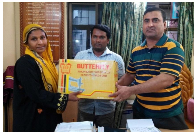
Distribution of Sewing Machine : Khagrachori PS