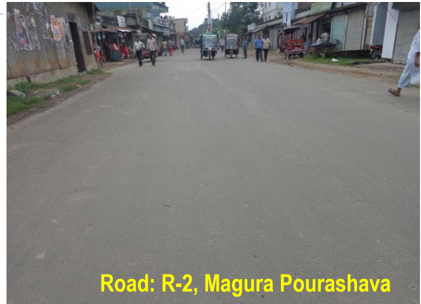
Road: R-2, Magura Pourashava