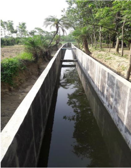
Drain at Charghat Pourashava