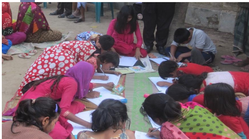
Children management during Courtyard meeting: Khagrachori PS