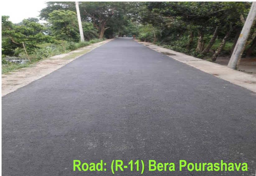
Road: (R-11) Bera Pourashava