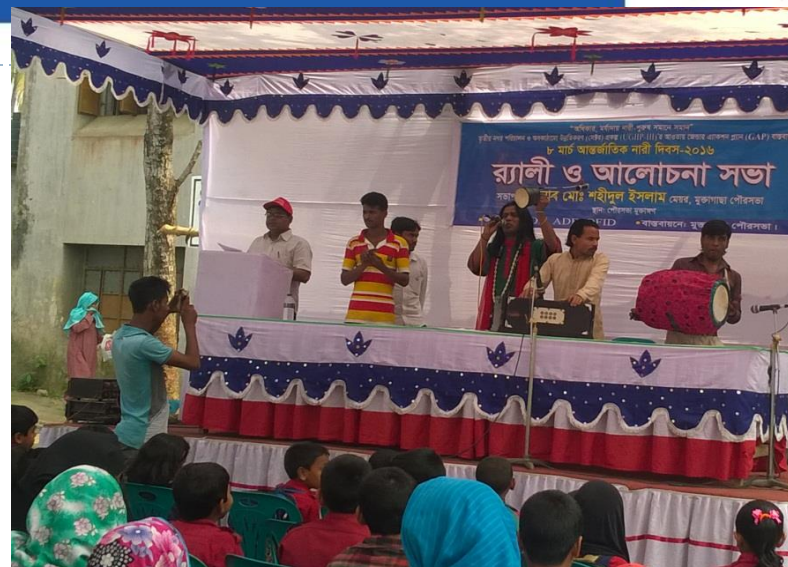
PS organized colorful events on IWD'16: Muktagacha