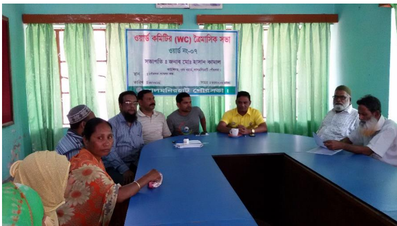
Word Committee Meeting at Lalmonirhat Pourashava