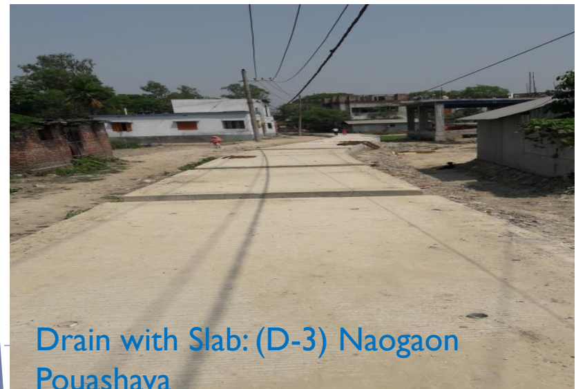
Drain with Slab: (D-3) Naogaon Pourashava