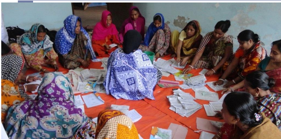
Package making training : Muktagacha PS