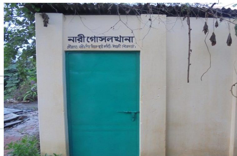
Bathroom for women in slum: Ishwardi PS