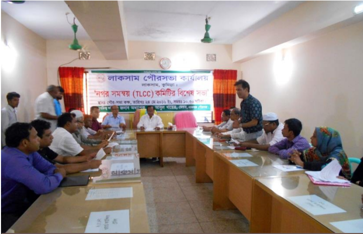
TLCC in Laksam Pourashava