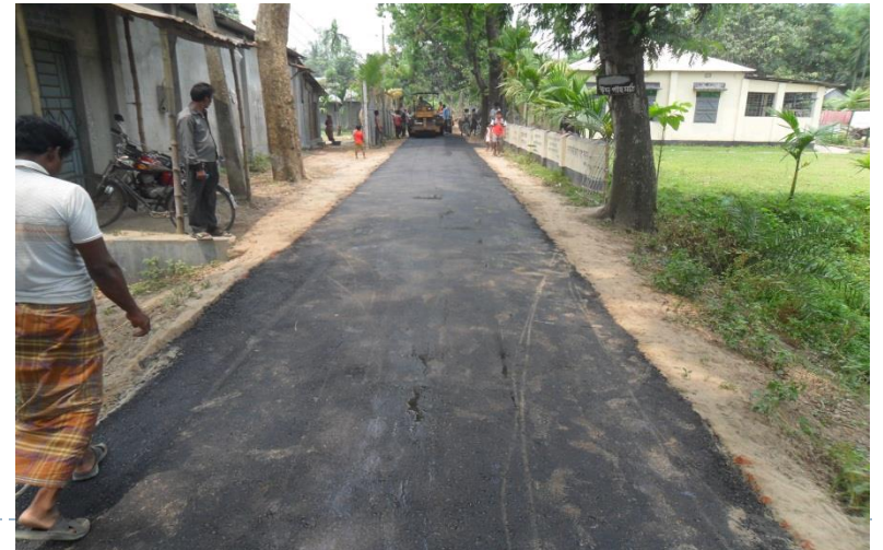
Road: Lalmonirhat Pourashava