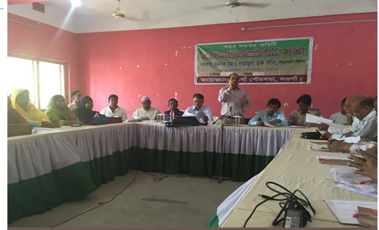
TLCC in Noagoan Pourashava