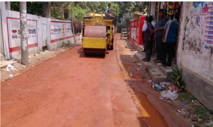
Road: Lakshipur Pourashava