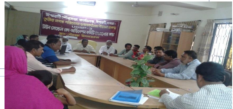
TLCC in Ishwardi Pourashava