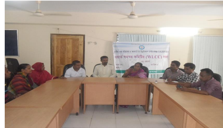
Word Committee Meeting at Kishoregonj Pourashava