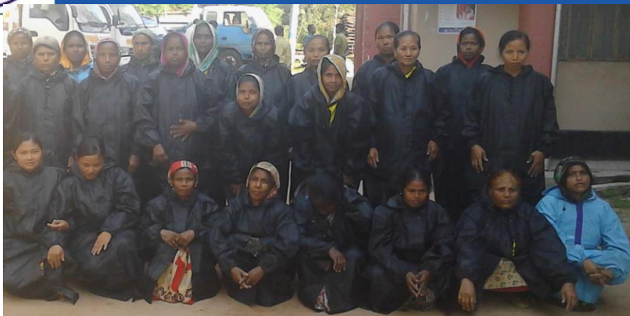
Raincoat provided to women cleaners Khagrachori