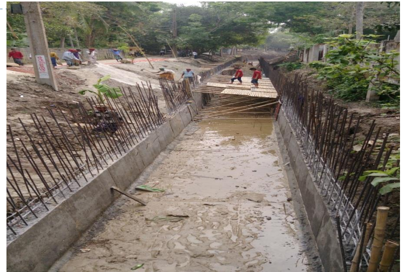
Drain: Rajbari Pourashava