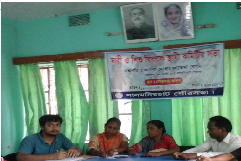
SC on WCA meeting : Lalmonirhat PS