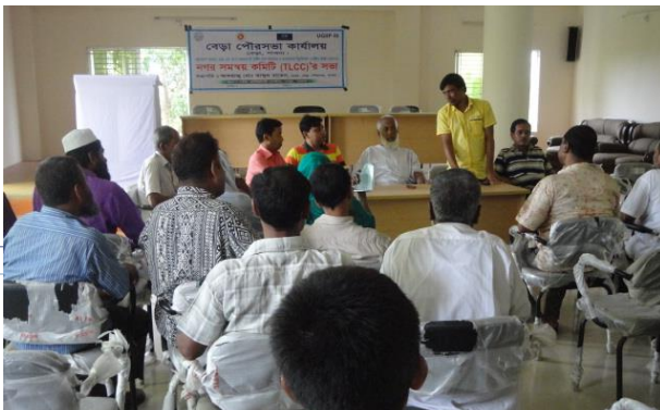
TLCC in Bera Pourashava