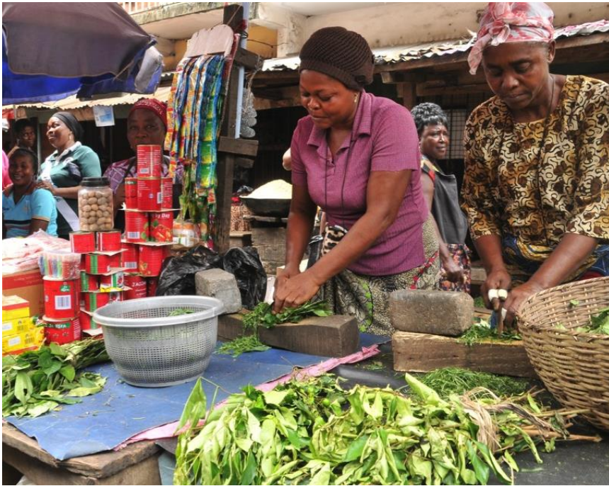
Investment in Digital Savings Proposition