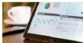
NAB Financial Exclusion Report