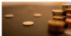
Managing Your Money