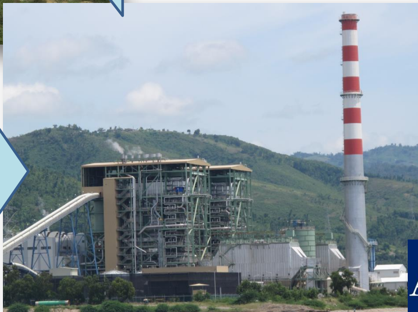
VISAYAS BASE-LOAD POWER DEV'T PROJECT (Philippines)