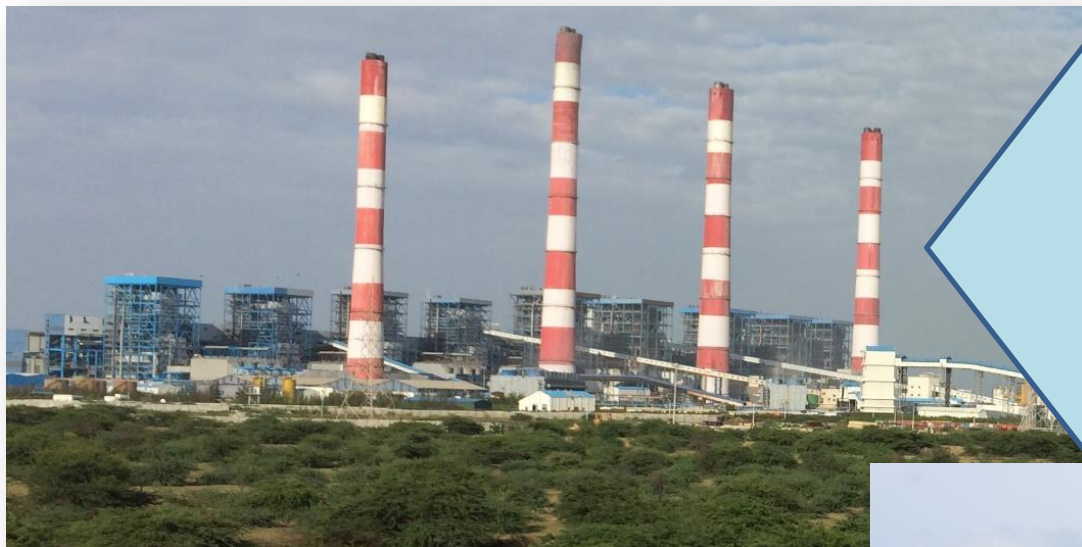
MUNDRA ULTRA MEGA PROJECT (India)