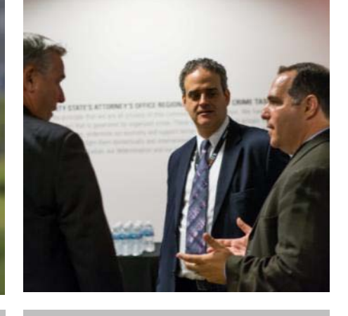
A Disaster Management Official contacts the City Mayor with progress reports on recovery efforts