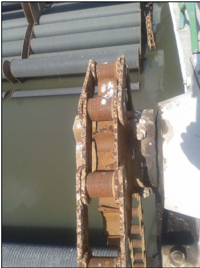
Large scale WWTP – after 4 years of operation

Problems need to be accepted to get solved