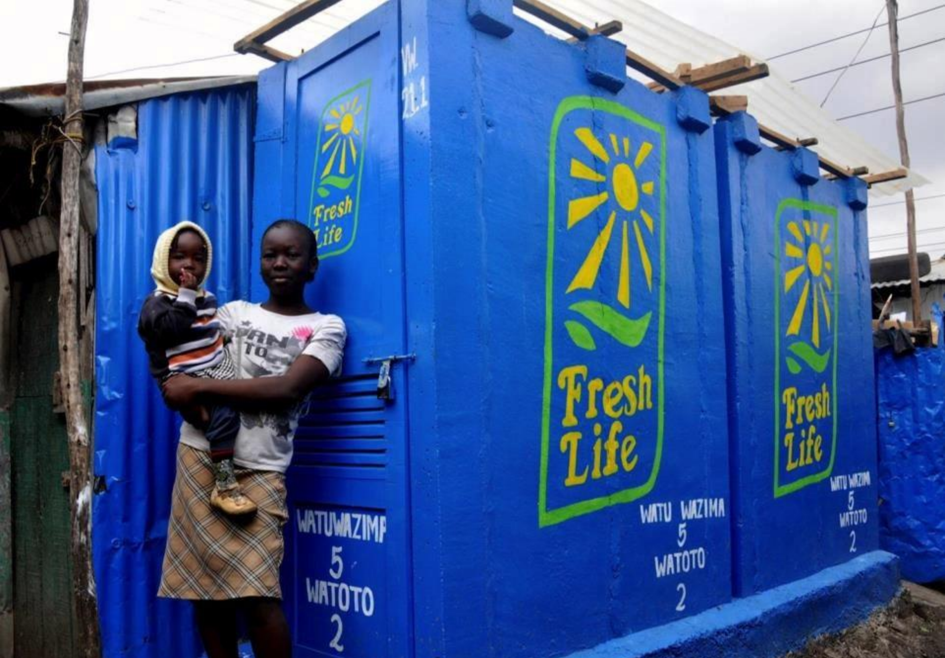
We franchise a dense network of aspirational, affordable, and durable toilets to local entrepreneurs, residents, and community institutions.