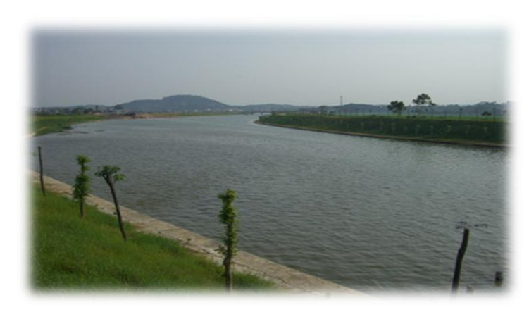
The management of small and medium rivers