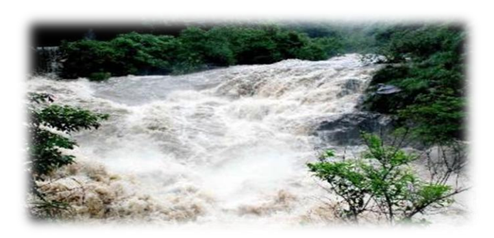
Prevention and management of flood disaster