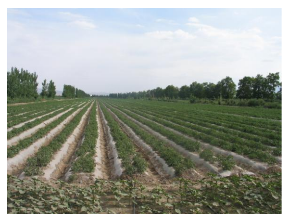
Dripping-irrigation under film