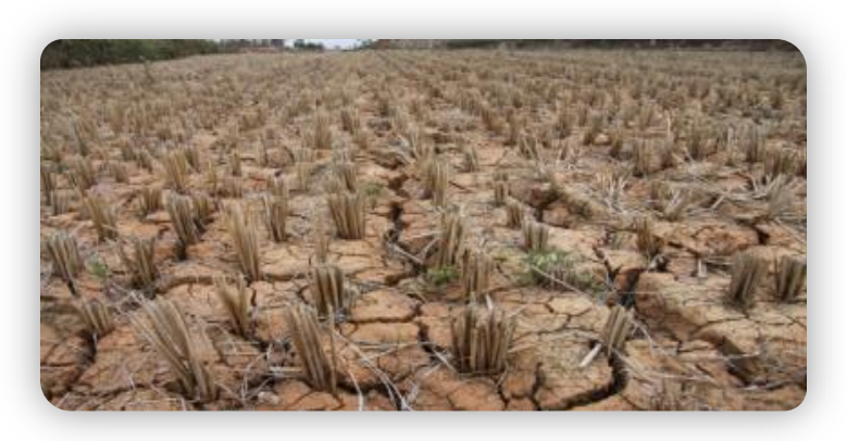
The national drought relief