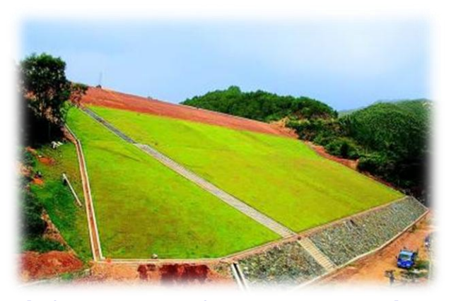
Reinforcement of small reservoirs