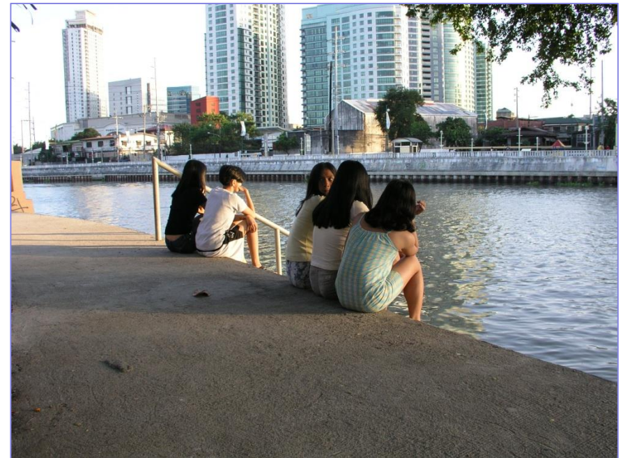
Pasig River embankments