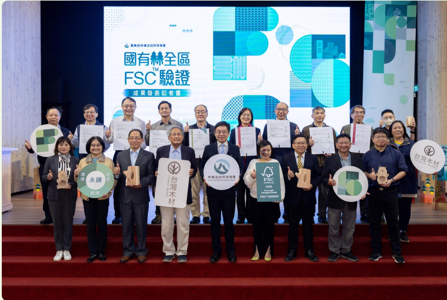
2024 Dec 11 – FANCA Full State-Owned Forest Certified Press Conference