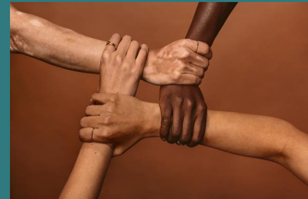
Our Global Customers and Consumers