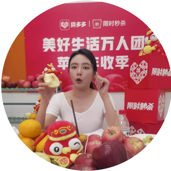
Apple Golden Week Livestream