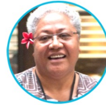
Honorable Fiamē Naomi Mata'afa Prime Minister of the Independent State of Samoa