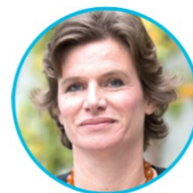
Mariana Mazzucato Professor in Economics of Innovation and Public Value, University College London & Founding Director, UCL Institute for Innovation and Public Purpose