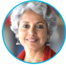
Dr Soumya Swaminathan Chief Scientist, World Health Organization