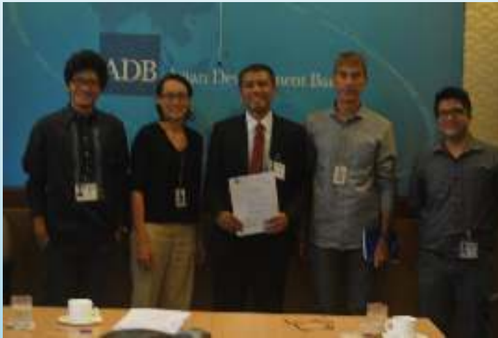
NEGOTIATION AT ADB HQ (22/08/2014) Clarification of workplan; revise financial proposal based on agreed workplan; signing minutes of negotiation and contract