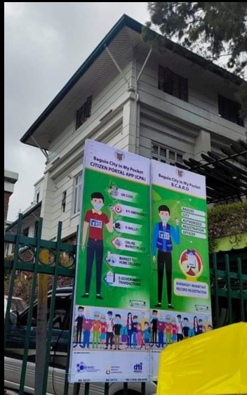
BAGUIO IN MY POCKET