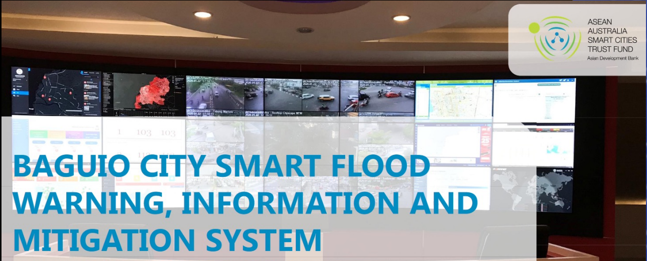
FLOOD EARLY WARNING SYSTEM