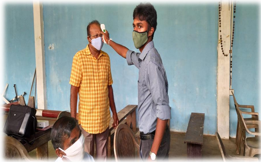
First community meeting at Old closed road of the Wetex ground GA 02, Gampaha was conducted by the staff of PIU, PIC, Contractor