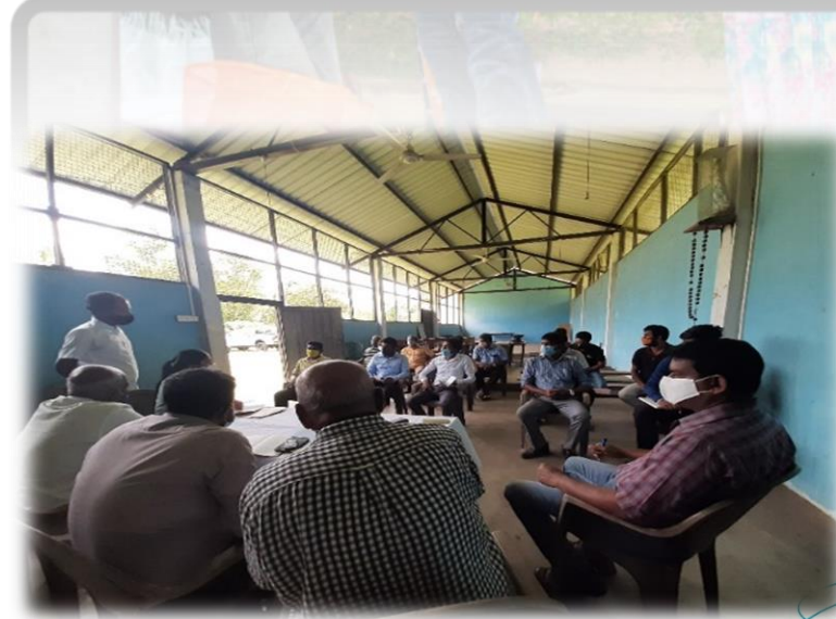
First GRC meeting at GN level was conducted for Old closed road of the Wetex ground GA 02, Gampaha