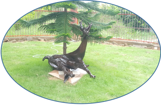
Black buck Deer from an abandoned tree root