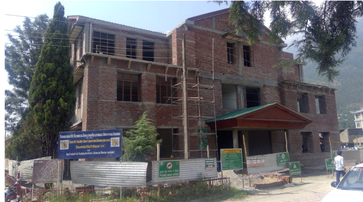
CLC Shamsi Structure