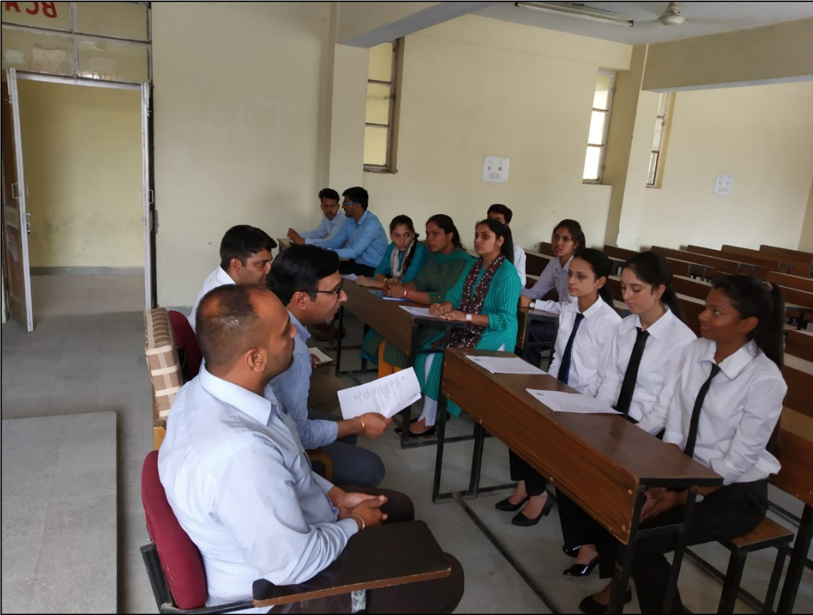
Mock interviews of Candidates, GDC Amb