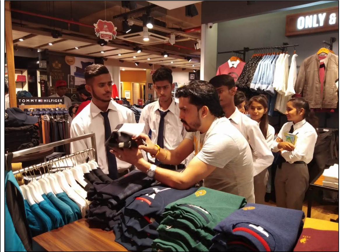
Hands on Training of OJT students at retail outlet in Chandigarh