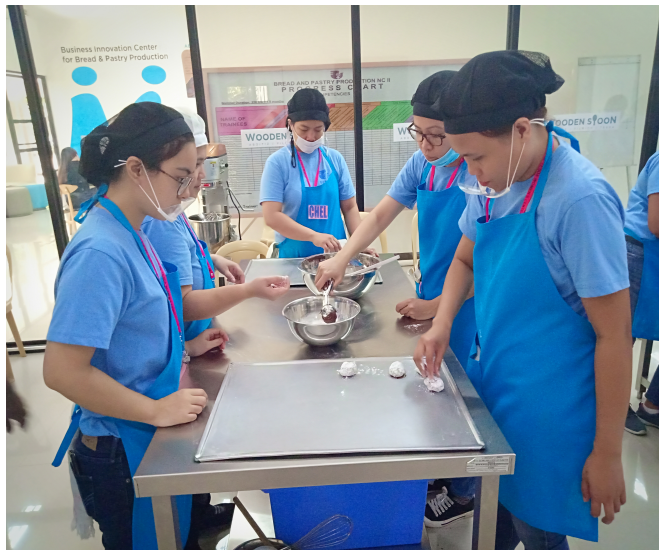
A training facility that can accommodate 25 trainees per batch