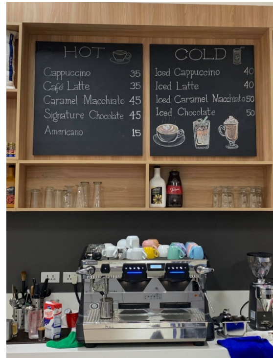
A café inside the facility which serve baked goods