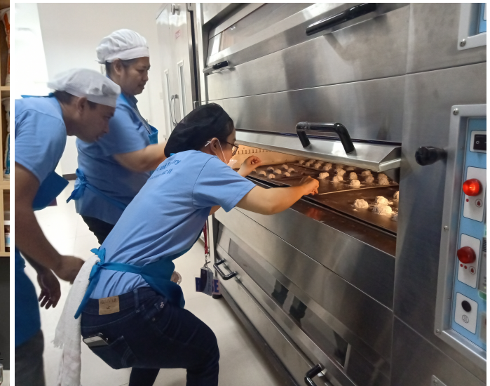
Up-to-date bakery and coffee machine with complete tools necessary for baking and preparing coffee beverages