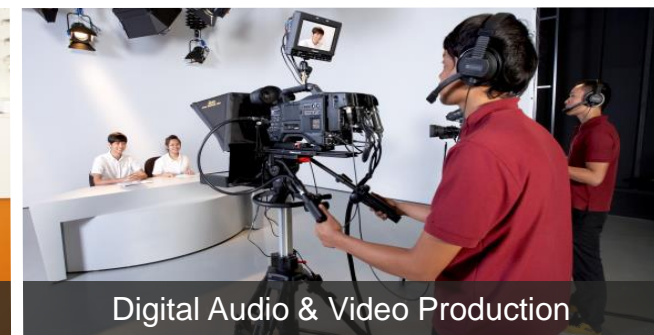
Digital Audio & Video Production