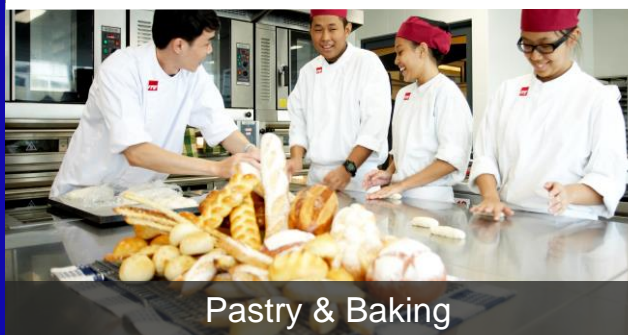
Pastry & Baking