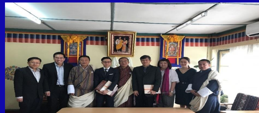
Conduct of TVET Needs Analysis for the Royal Government of Bhutan