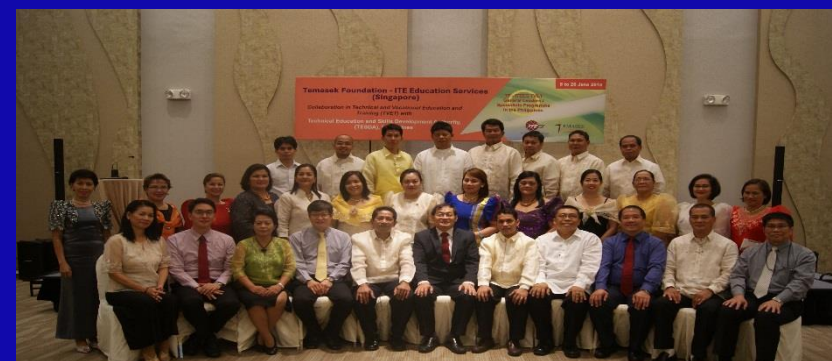
Industry-Based Training Programme for TESDA, Philippines