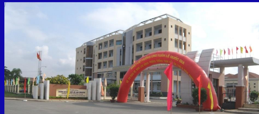
Vietnam-Singapore Vocational College