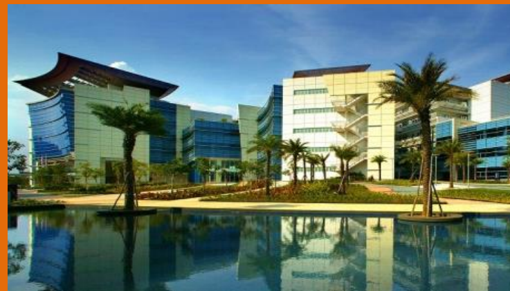
ITE College East (2005)