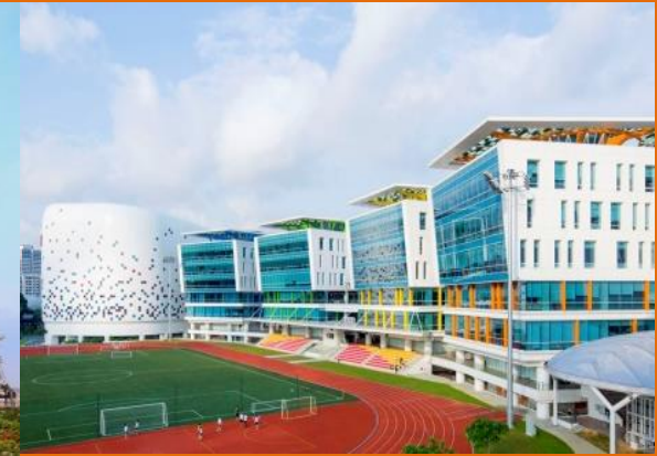
ITE College Central (2013)