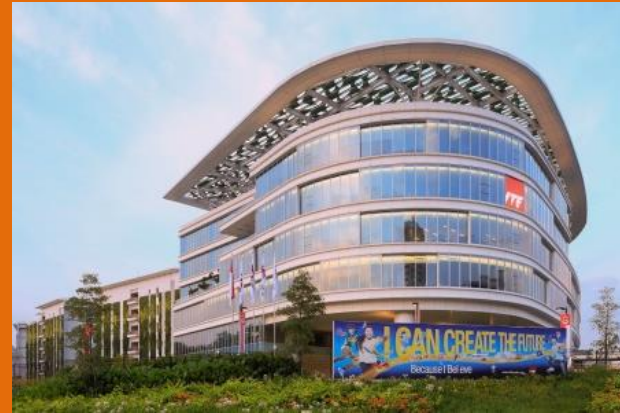
ITE Headquarters (2013)