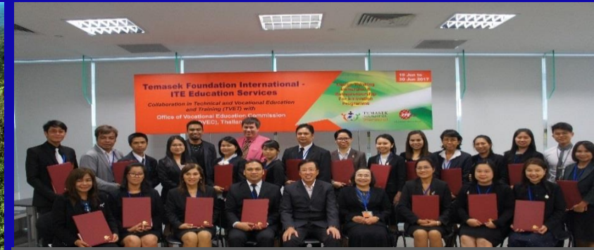
Design Thinking Immersion Programme for OVEC, Thailand