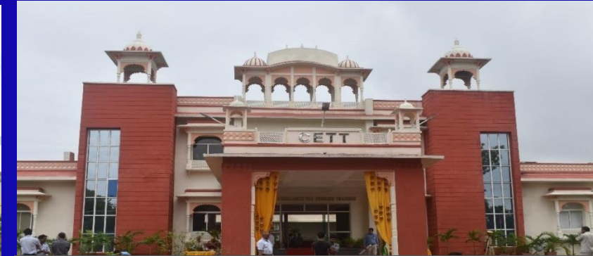
Centre of Excellence for Tourism Training in Udaipur, Rajasthan, India