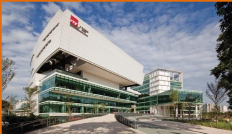
ITE College West (2010)

➤ Now - “1 ITE System, 3 Colleges” Governance and Education Model