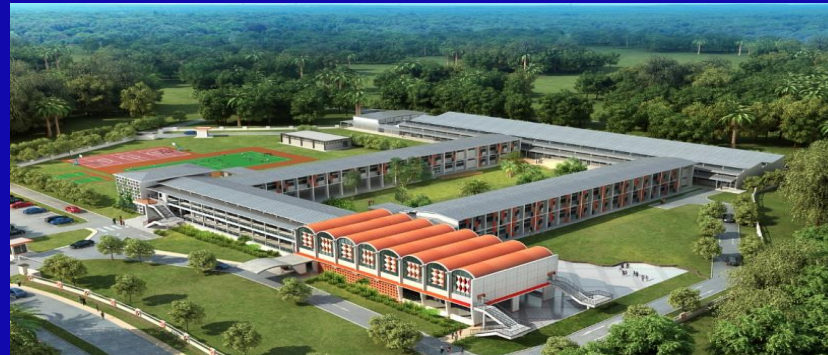
Singapore-Myanmar Vocational Training Institute