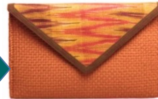
R2R FASHION AND HOME ACCESSORIES