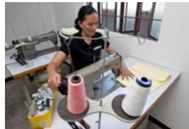
R2R WORKSHOP ARTISANS