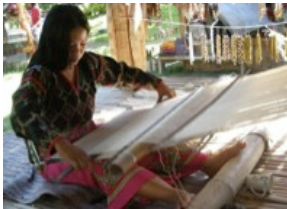
RURAL, INDIGENOUS ARTISANS