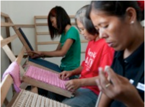
URBAN POOR ARTISANS