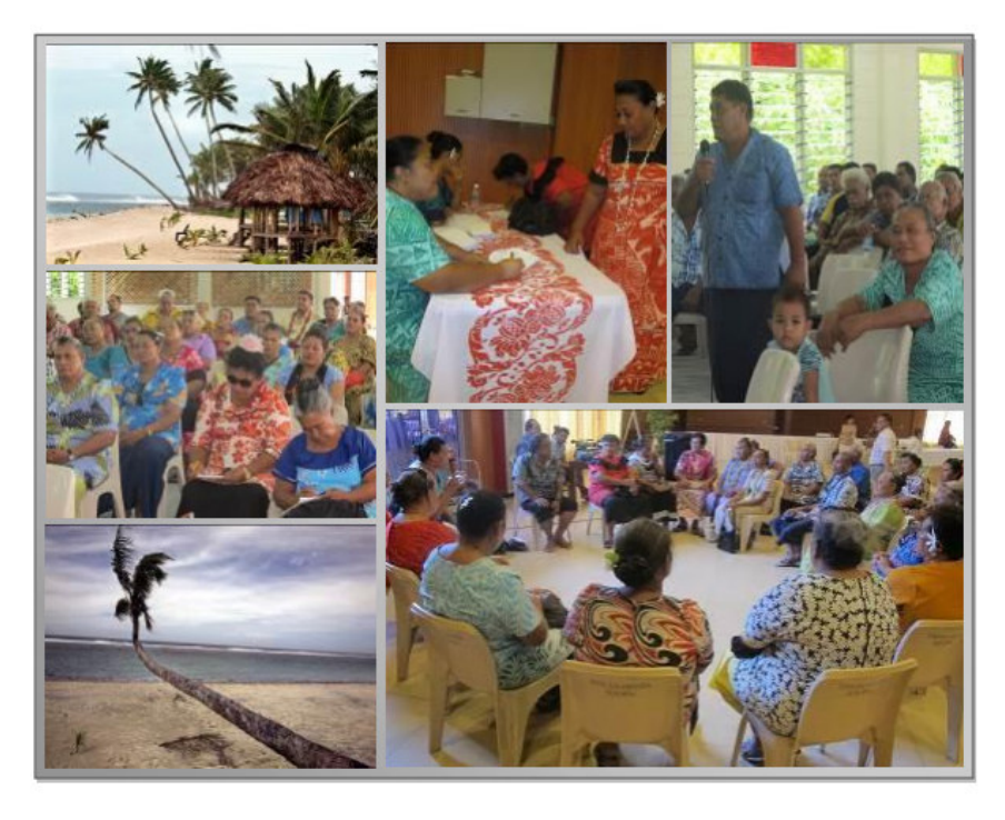
TA 8481-SAM: Economic Use of Customary Land, Phase III & ADF 0392-SAM: Samoa Agri-Business Support Project