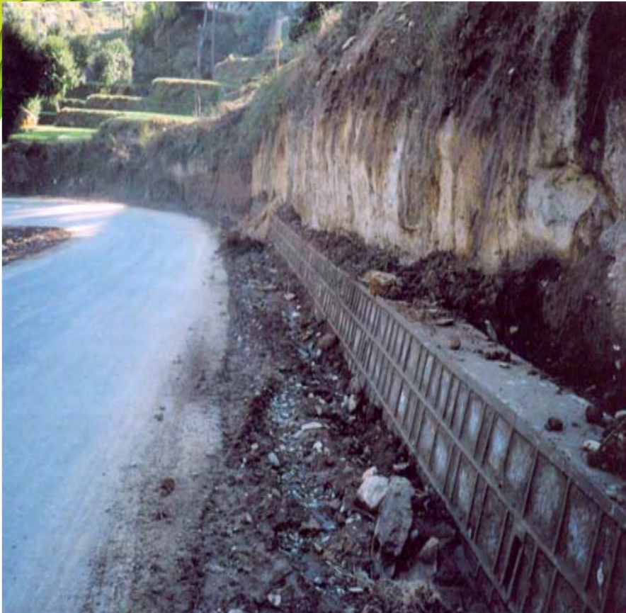
Slope improperly cut & no drains constructed