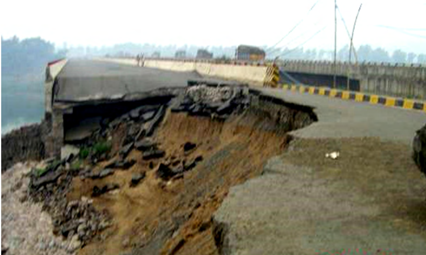
Washed out approach of bridge