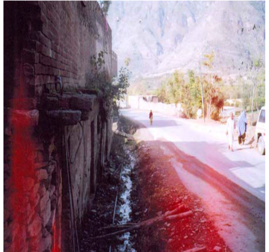
Drain made by local residents