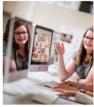
International TP Chisholm Institute ATA

Versatile in design, the courses have been developed for delivery across a wide range of skill sectors. Additionally, training providers have the flexibility to deliver the courses to learners using a range of delivery methods, such as online.