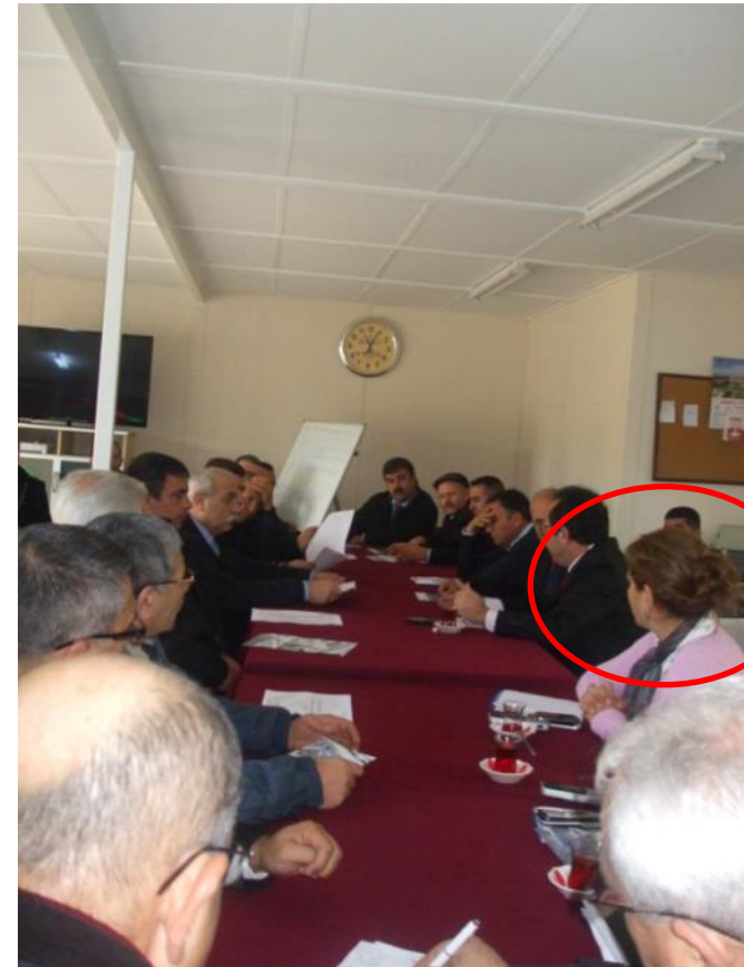
© EBRD/ TAV EGE-Ismir Airport Project SEP, Turkey