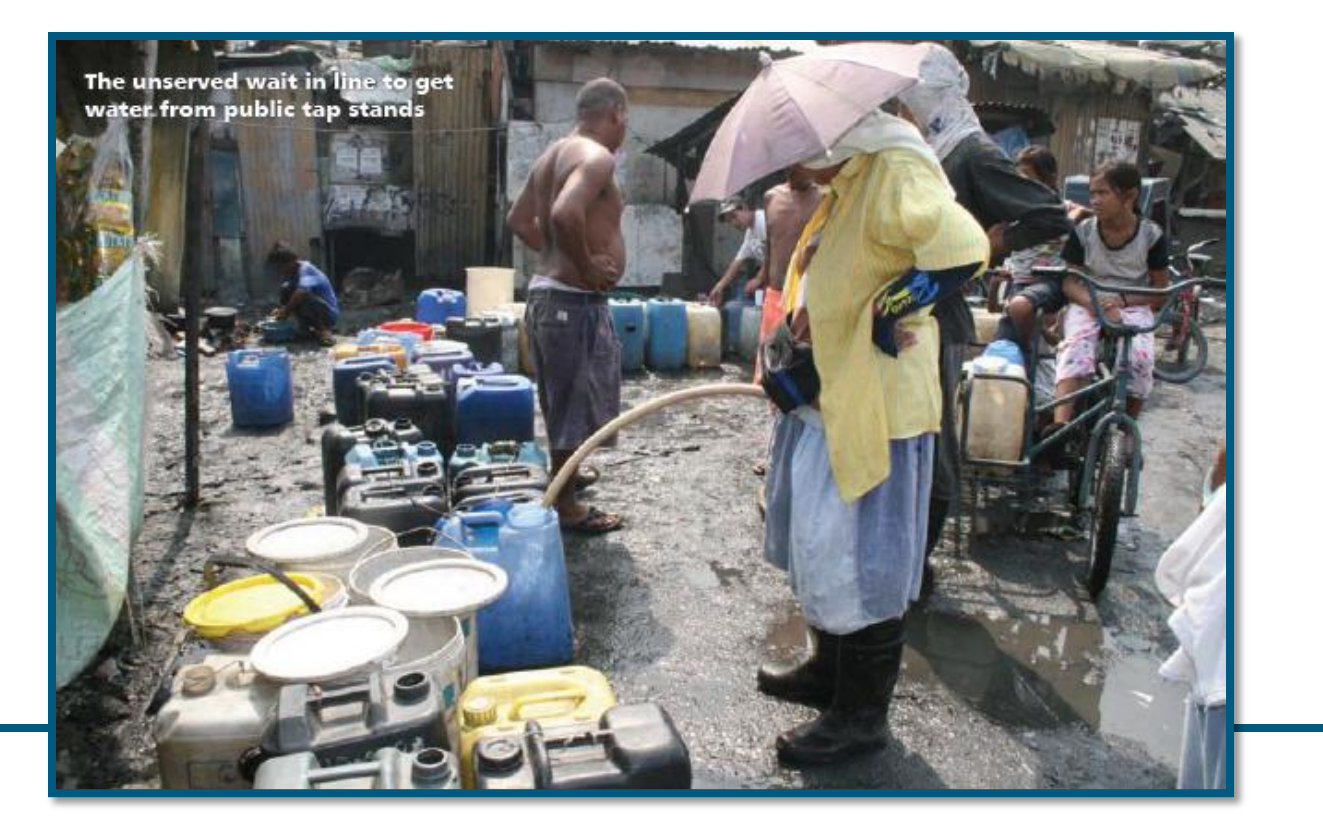
Figure 2. A line for a public tap in the early days of the Maynilad service zone. Although the piped water is likely clean coming from the tap, the area exhibits a poor standard of hygiene that could pose contamination risk. The

This study computed various tests to arrive at its results,