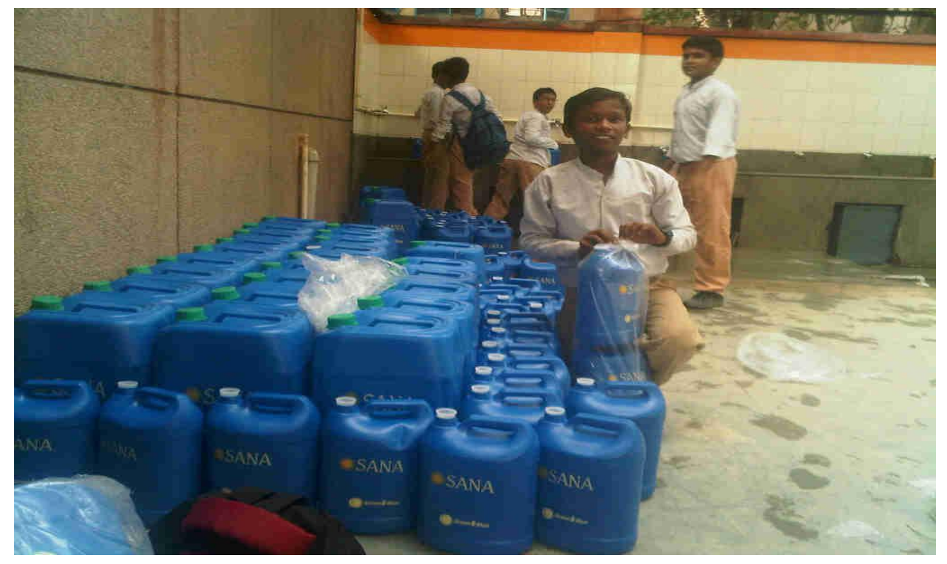
Photos shown above are the commissioning of the project. 2<sup>nd</sup> photo - the filtration plant. 3<sup>rd</sup> photo - teachers are assembling the filtration plant. Last photo - the distribution of water bottles.