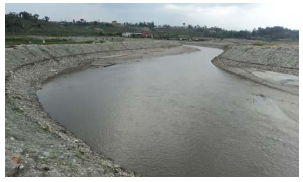
Construction of Infrastructure @ Gokarna – Guheswori (Zone 3)